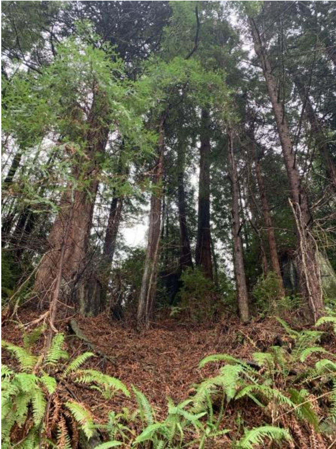
The redwood forest in Unit A is currently under threat of logging. Trees in the area are up to a few hundred years old, many are labeled as “wildlife” trees.