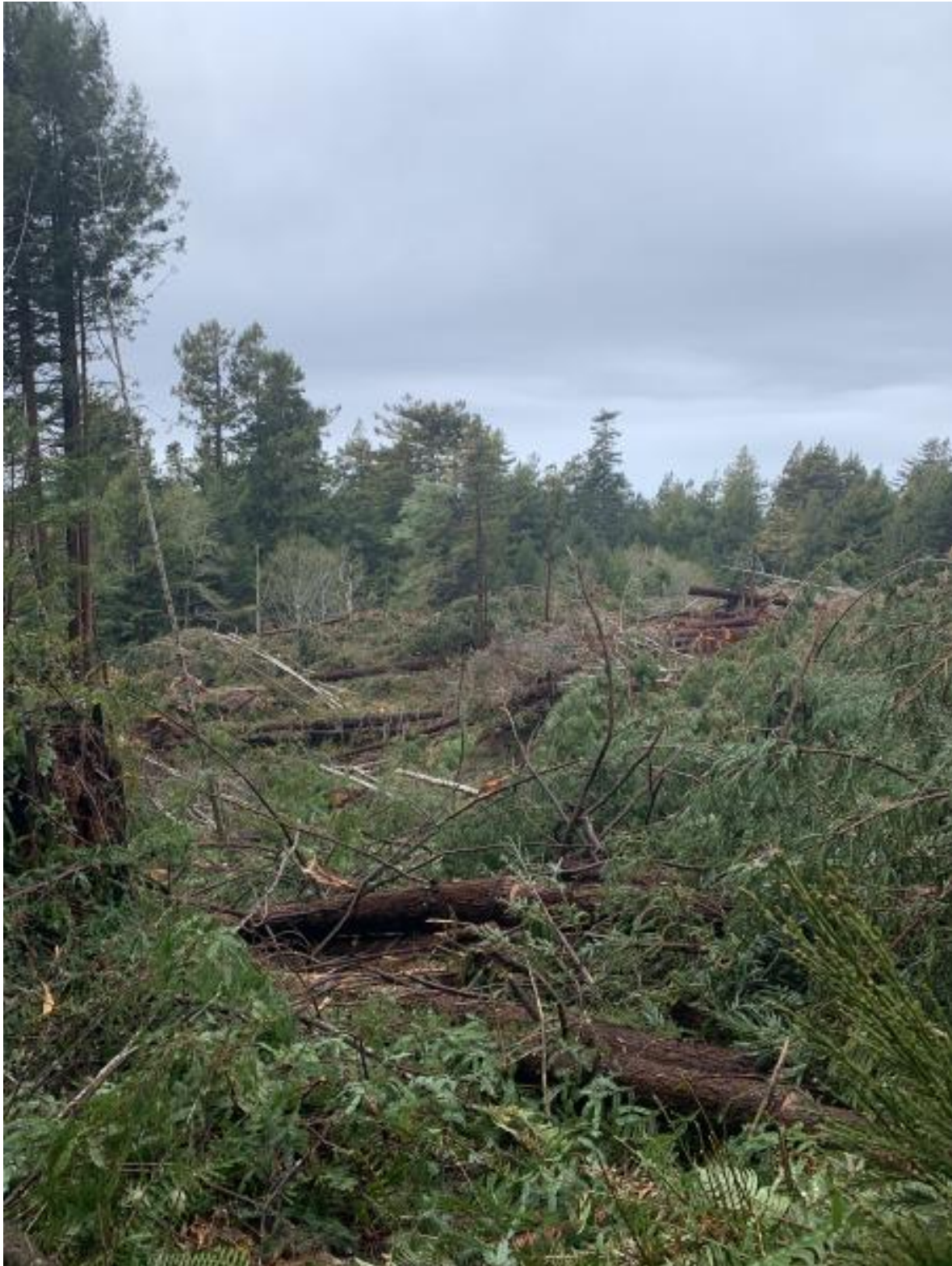
Another photo of “even-aged” management.